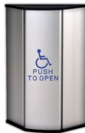
MODEL 4440NAC 9-IN COLUMN