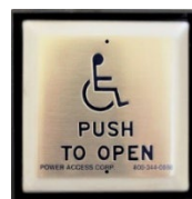
MODEL 4495SQ 4.5-IN SQUARE PUSH PLATE