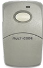
MODEL 4440T REMOTE