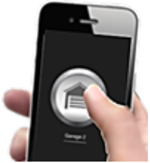
MODEL 5555 APP