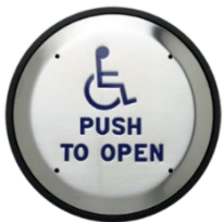
MODEL 4496SR 6-IN ROUND PUSH PLATE