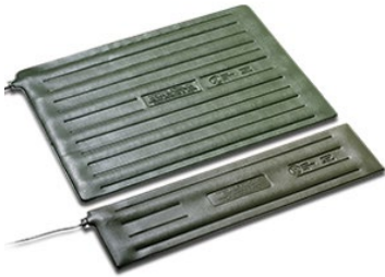
MODEL 4439 CVP PRESSURE MAT