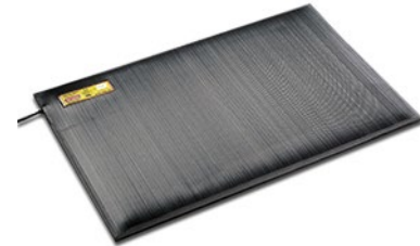
MODEL 4459 CKP PRESSURE MAT