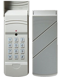
MODEL 4437S KEYPAD